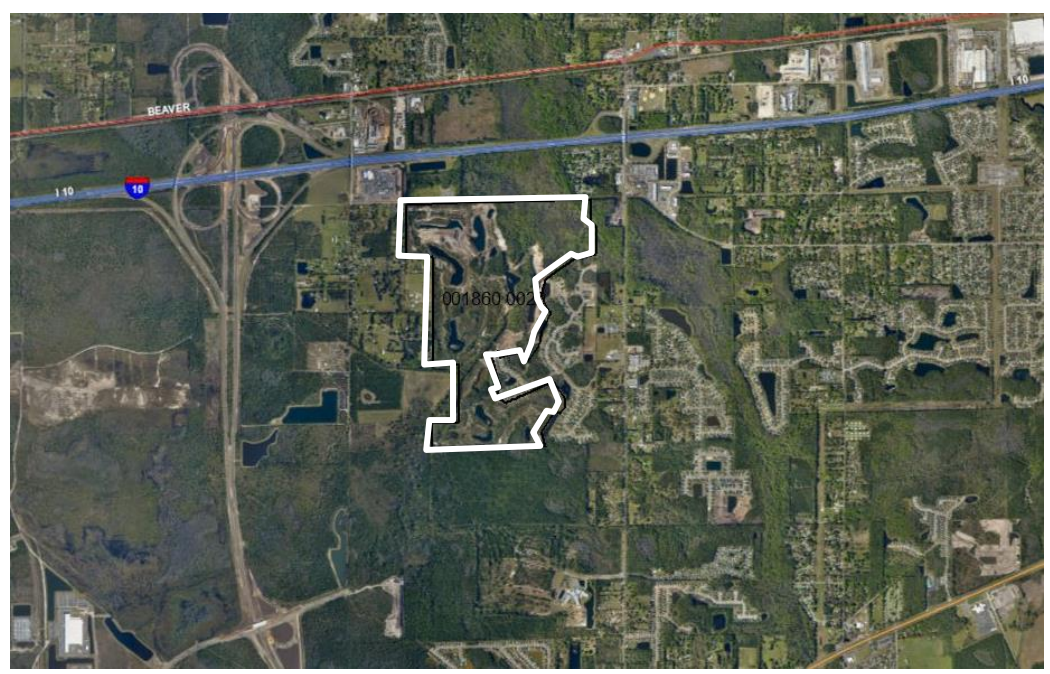
Date: December 15, 2016

Based on the foregoing, it is the recommendation of the Planning and Development Department that the application for Rezoning 2016-0807 be APPROVED .