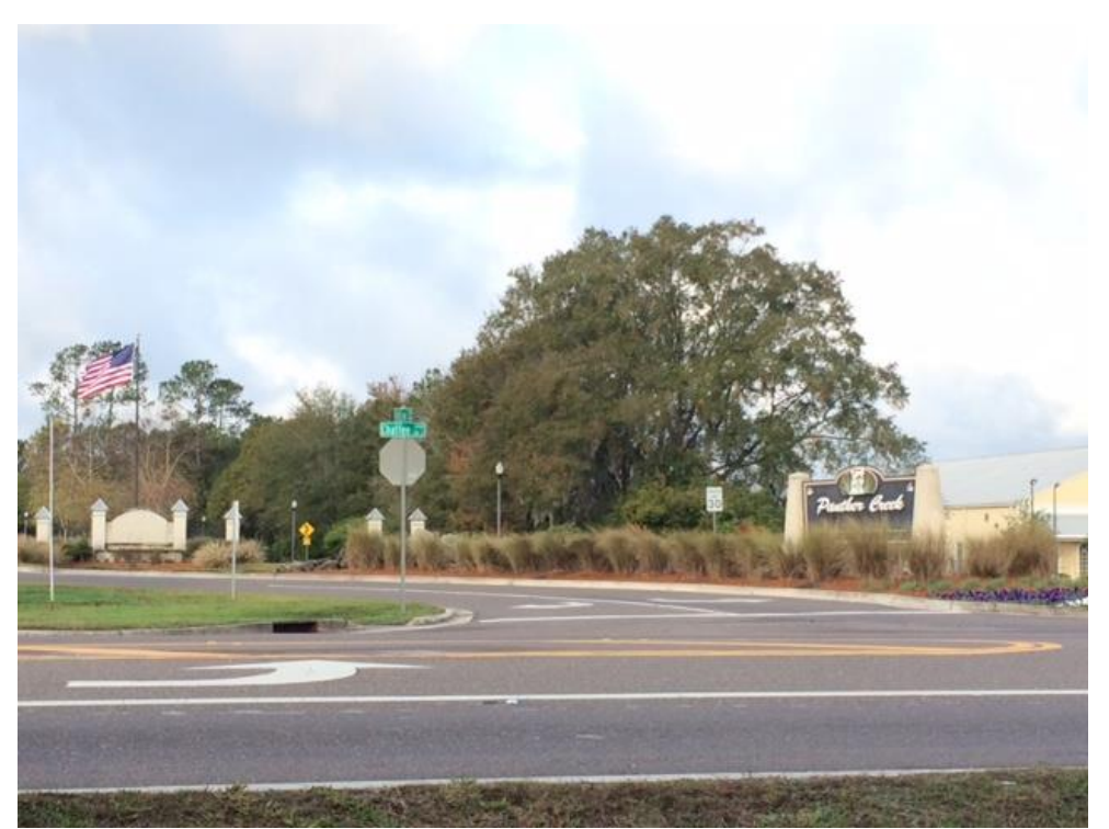
Panther Creek subdivision entrance from Chaffee Road Date: December 15, 2016