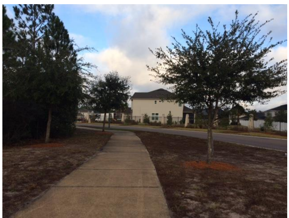
View to the north from the proposed entrance of the subject site Date: December 15, 2016