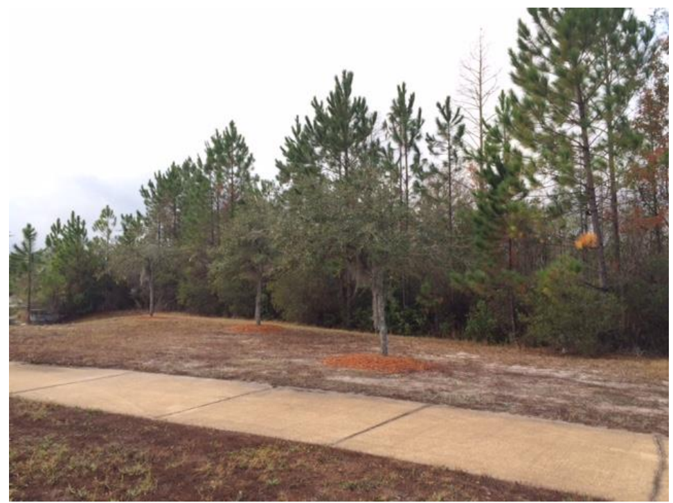
Subject Site Date: December 15, 2016