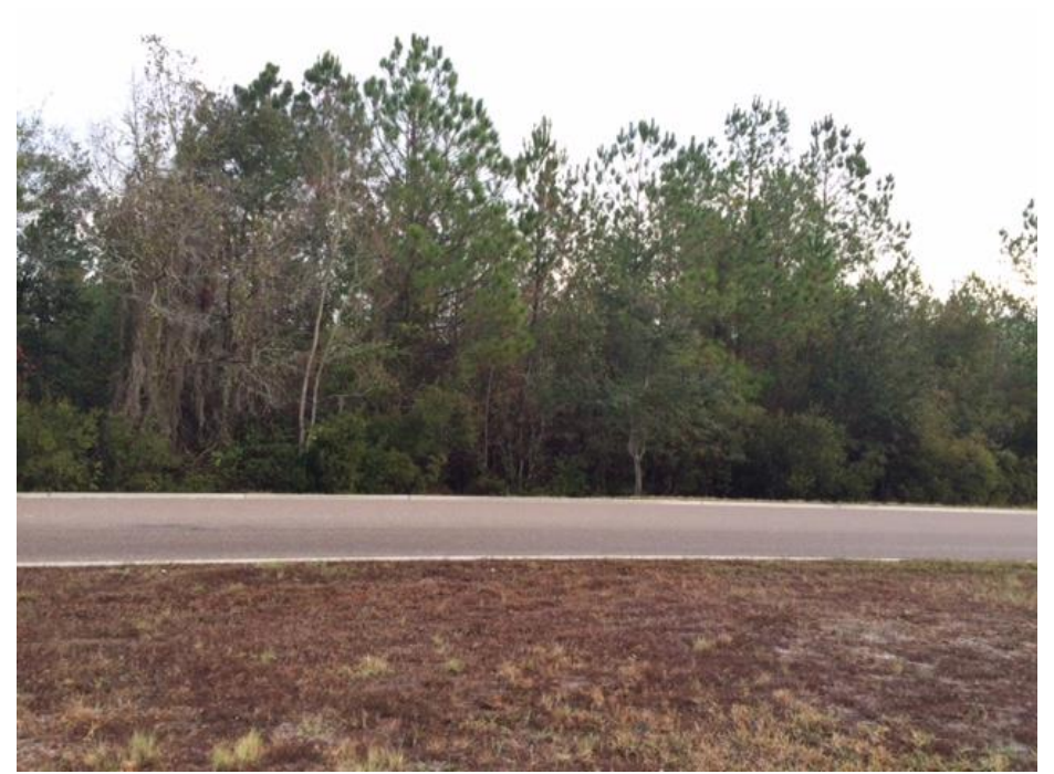
Property directly across from the proposed entrance to the subject site Date: December 15, 2016