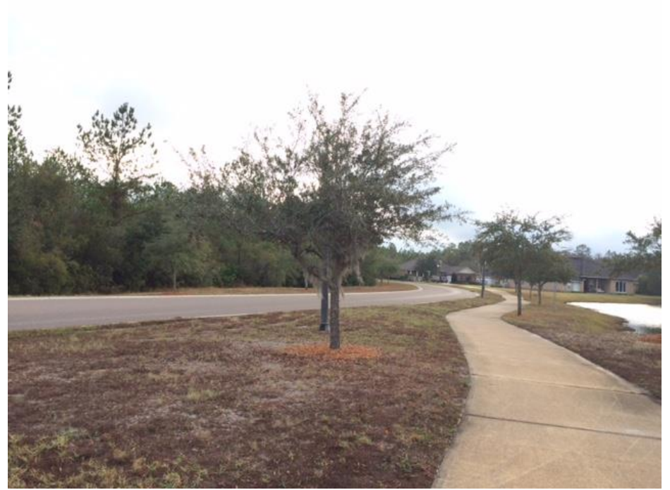
View to the south from the proposed entrance of the subject site Date: December 15, 2016